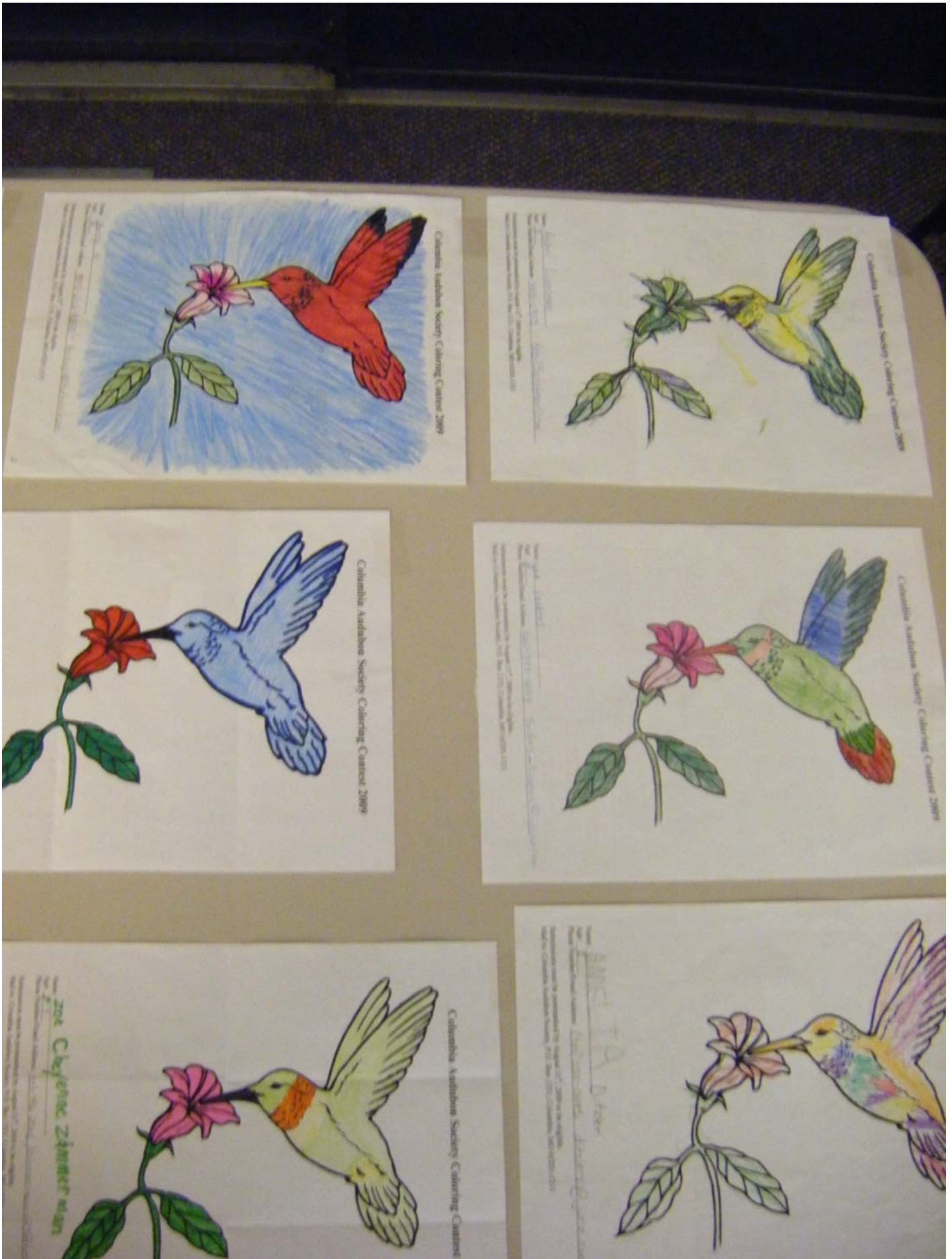
Some of the artwork submitted for the coloring contest.